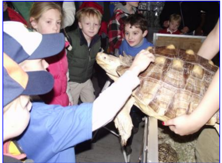
Cub Scouts from Stamford Pack 6 enjoy a big turtle at the Animal Embassy building at the Stamford Museum and Nature Center.

For fun, fellowship and ideas to run your Pack... Come to Roundtable, Wednesday, Jan. 11 7:00 PM Gathering — 7:15 Program at the LDS Church 676 South Ave., New Canaan