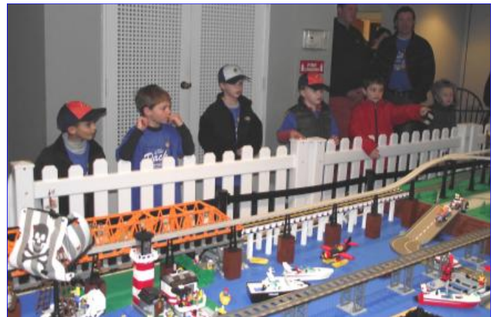
Stamford Pack 6 enjoying the cool Lego Train display at the Stamford Museum and Nature Center.