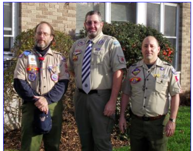
Connecticut Yankee Council Recognition Dinner & Annual Meeting