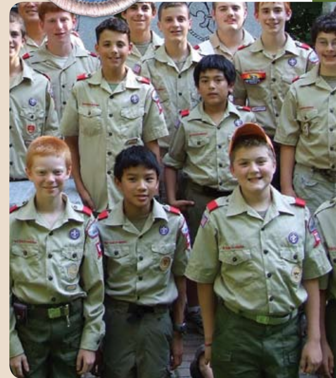
Scouts at Maxim Chapel