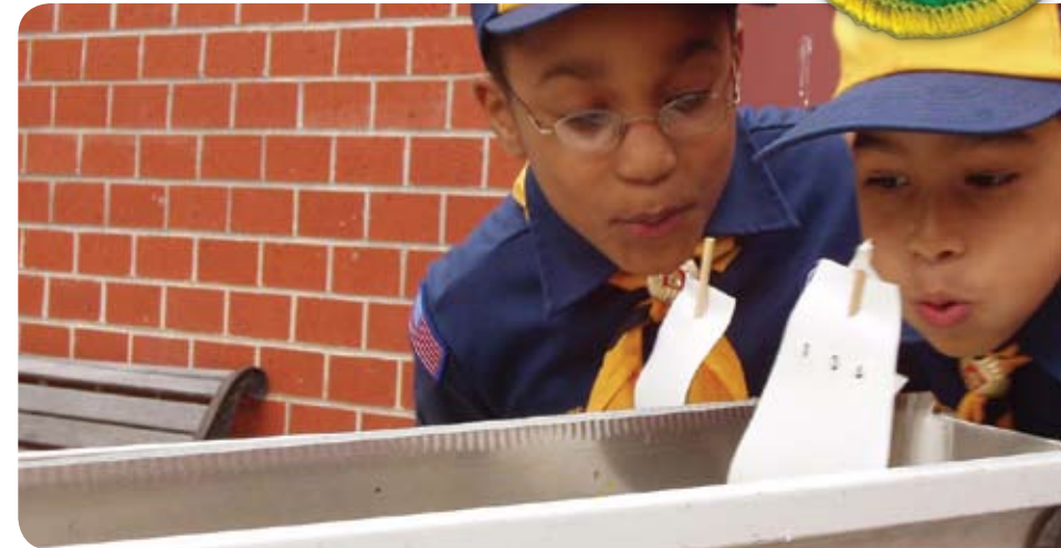
Raingutter Regatta in Stamford

It is the mission of the Connecticut Yankee Council, Boy Scouts of America, to serve others by helping to instill values in young people and in other ways prepare them to make ethical choices over their lifetime in achieving their full potential. The values we strive to instill are based on those found in the Scout Oath and Law.