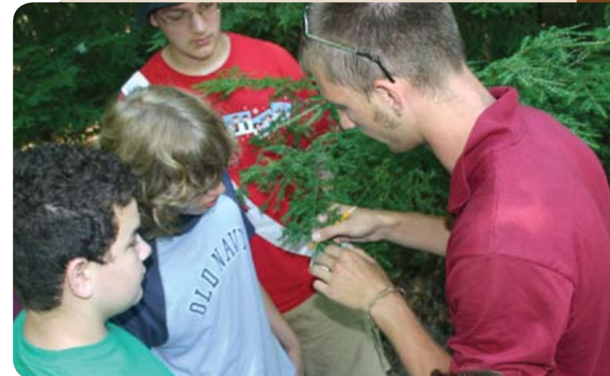
Nature Studies at Sequassen

...on average about 200,000 lbs. of food annually for local food shelves.