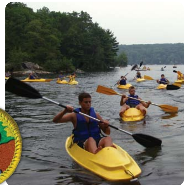
Kayaking at Sequassen