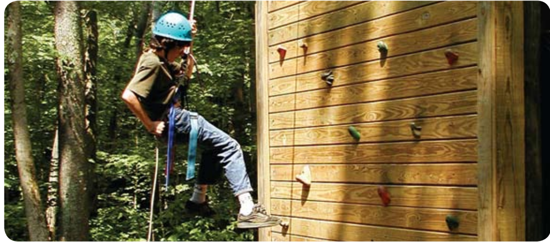
Climbing Wall at Camp Sequassen