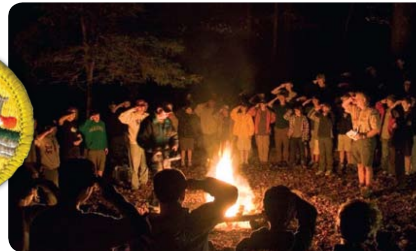
Troop Campfire at Hoyt Scout Camp