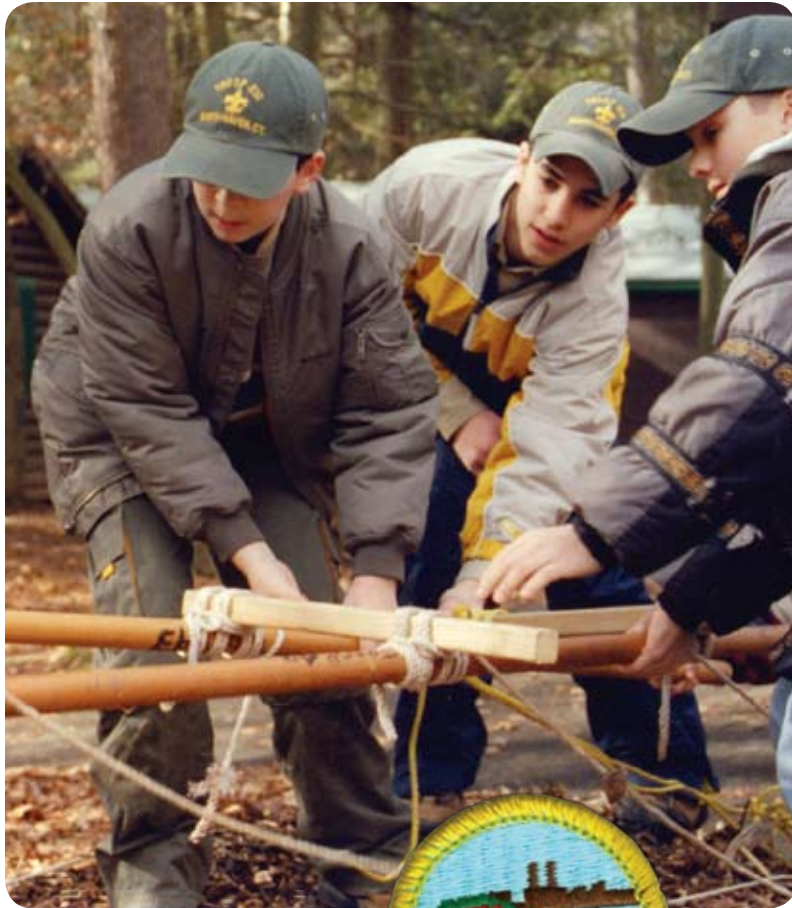
Lashing a climbing tower