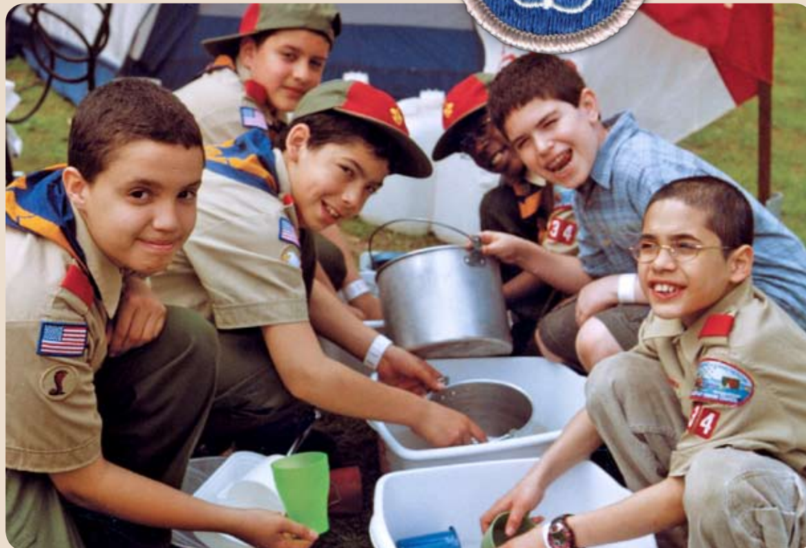
Bridgeport Troop 34