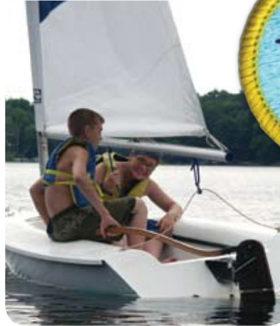
Sailing at Sequassen