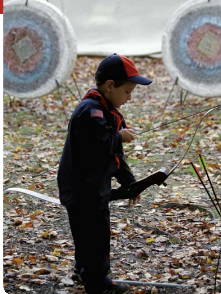
Cub Scout Field Day