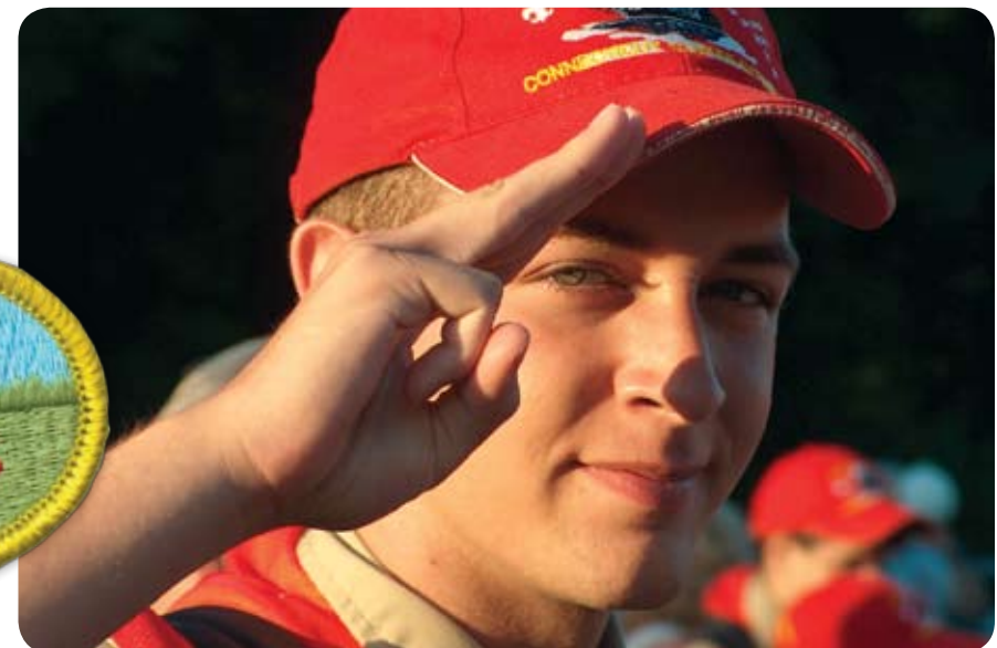
Jamboree Departure Day in Norwalk