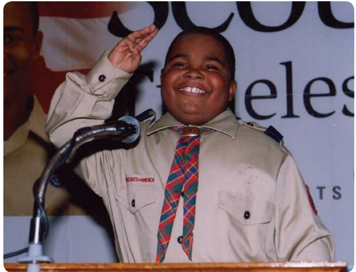
Scoutreach speaker at New Haven event

The adage "think globally, act locally" is an important element for today's young people. Preserving resources is something that everyone can do from recycling, to cleaning a park, to conserving water at home.