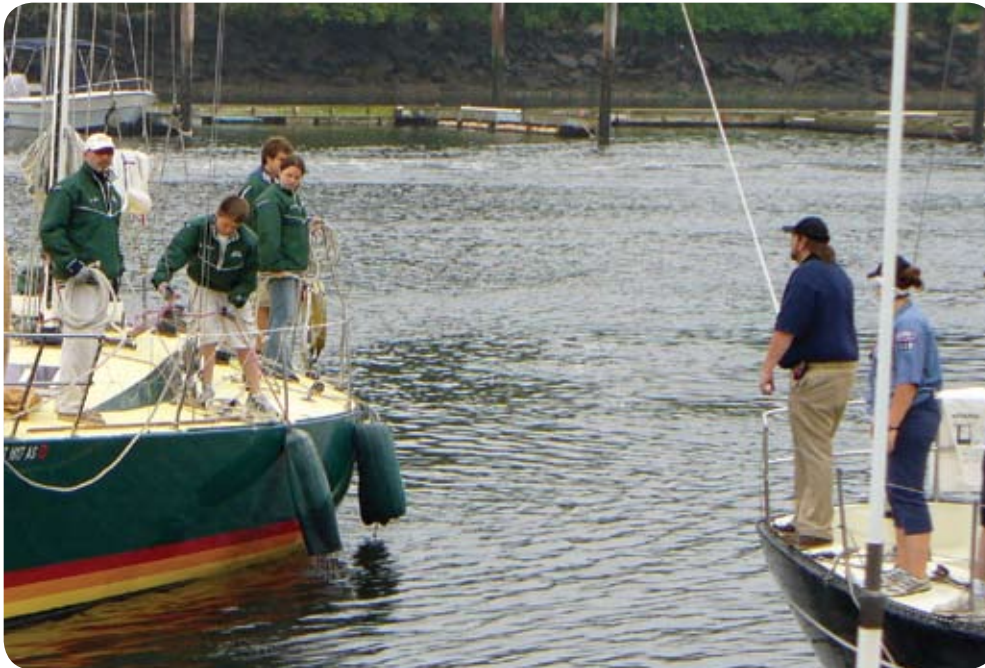
Sea Scouts at GAM Weekend