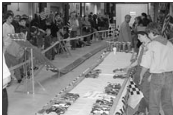
Below – The District Pinewood Derby was hosted at McDermott Chevrolet.