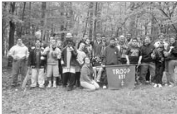
Troop 620, from ACES Whitney High West, spent May 23 at Wah Wah Taysee experiencing camping at its best. The Scouts put up a tent, gathered wood for the fire, hiked, played ball, worked on their art merit badge and caught a huge bullfrog.