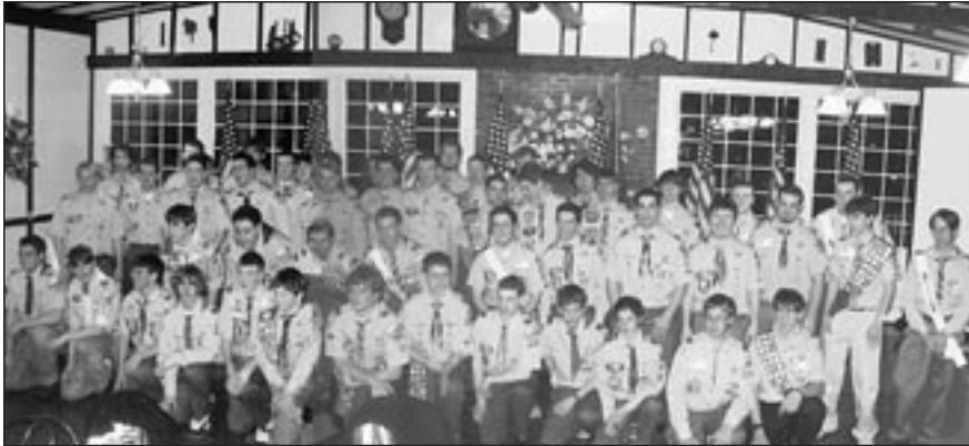
The 2006 Class of Eagle Scouts in attendance at the annual Eagle Scout Recognition Dinner on March 22.