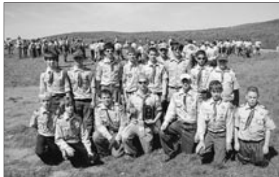
Above – Scouts from Troop 428 at West Point Military Academy.

The popcorn season is approaching. If your Unit does not have a Kernel please recruit one to assist your unit the upcoming sale.