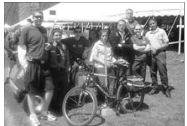
Explorers from Hunter's EMS Explorer 181 volunteer with First Aid at the 2006 Meriden Daffodil Festival.