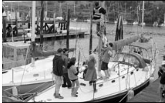
Sea Scouts hone their skills at the annual GAM at Captain's Cove.

Seabadge NE-XVII is October 5-7 at the US Coast Guard Training, Cape May, NJ. Seabadge is an advanced leadership training experience for Sea Scout Officers