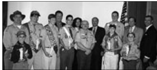
Scout honorees and their hosts gather for a group shot at the first annual James E. West Community Scout Award Breakfast.