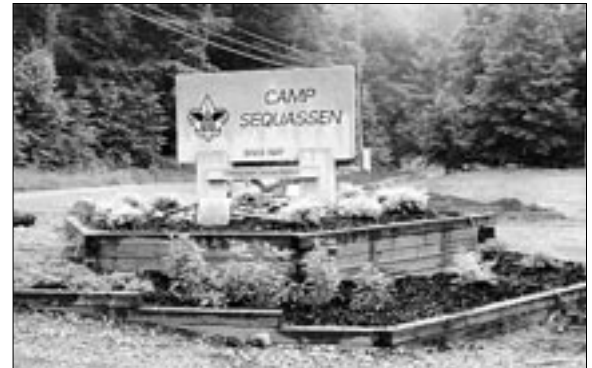
A new marble sign welcomes Scouts and visitors to Camp Sequassen.