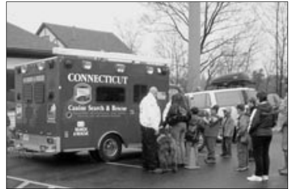
Above – Sleeping Giant District and Hunter's Ambulance Explorer Post hosted a Touch a Truck event to introduce new families to Scouting.

DEA Drug Abuse Prevention Service Award (Law Enforcement, $1,000) – The DEA Drug Abuse Prevention Service Award consists of an engraved plaque and a $1,000 award, which will be presented in recognition of Proficiency Awards program provides an opportunity for posts and