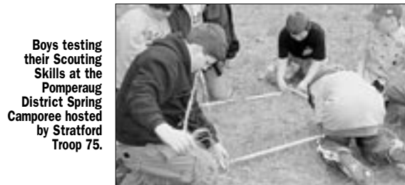
Boys testing their Scouting Skills at the Pomperaug District Spring Camporee hosted by Stratford Troop 75.