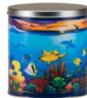
2.5 Oz Mauve Sea Salt Tin 8 Containers/Case $15.00