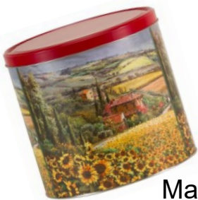
Mauve Variety Tin