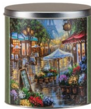
Supreme Caramel Crunch/ Almonds, Pecans and Cashews 20 oz. 8 Containers/Case $20.00