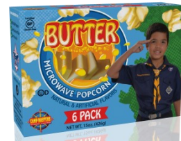
6 Pk Butter Microwavable 8 Containers/Case $5.00 during Show & Sell $10.00 on Take Order form