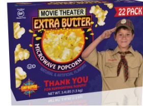
22 Pk Movie Theater Extra Buttery Microwavable 6 Containers/Case $20.00