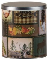
8 oz. Caramel Corn Tin 8 Containers/Case $10.00