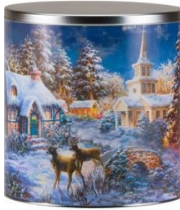
5 Way Chocolatey Treasures Tin 74 oz. (Available ONLY for Take-order) 1 Containers/Case $50.00