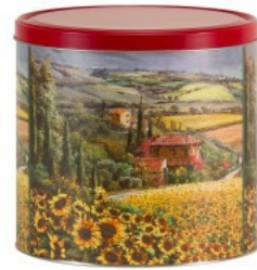
Mauve Variety Tin Real Butter & Kettle Corn 1 Containers/Case $30.00