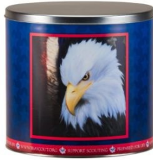
3 Way Cheesy Cheese Tin 15 oz. 1 Container/Case $30.00