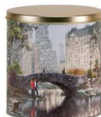
White Cheddar Tin 5 oz. 8 Containers/Case $15.00