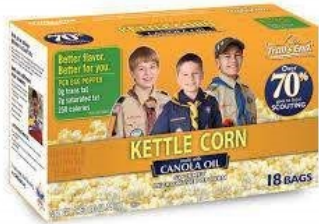
12 Pk Sweet & NSalty Kettle Corn Microwavable 8 Containers/Case $20.00