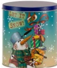
Chocolatey Drizzle Caramel w/Nuts Tin 8 Containers/Case $25.00