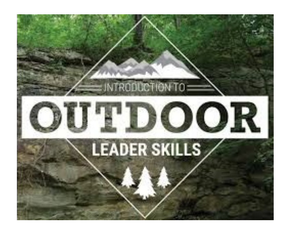
Spring 2021 - Introduction to Outdoor Leadership Skills

Working as patrols, this hands-on course provides adult leaders with the practical outdoor skills they need to lead Scouts in the out-of-doors. Upon completion, leaders will feel comfortable teaching Scouts the basic skills required to obtain the First Class rank. To be considered fully trained as a Scoutmaster or Assistant Scoutmaster, leaders must complete Scoutmaster Specific Training and this course, Introduction to Outdoor Leader Skills.