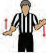
Illegal or Double Dribble