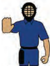
Do Not Pitch