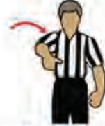
Carrying or Palming the Ball