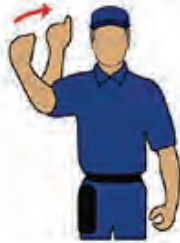
Out or Strike