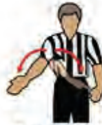
Over and Back (Half-Court Violation)