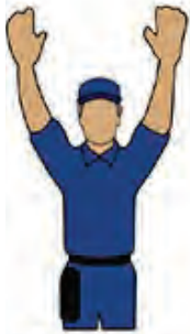
Time Out or Foul Ball