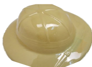
Safari Hat Provided

Come Safari for the day or plan for overnight family camping. A lunch truck will be provided (not part of the fee). Packs camping will provide Saturday dinner and Sunday breakfast.