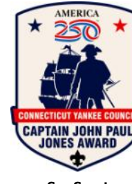
Sea Scouts Capt. John Paul Jones Award Celebrating Sea Scouting's Revolutionary heritage