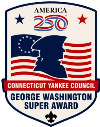
Super Hero Award George Washington

Scouts can earn any choice of the Awards number 1 to 5. Sea Scouts can earn any 4 of the awards plus Award #6