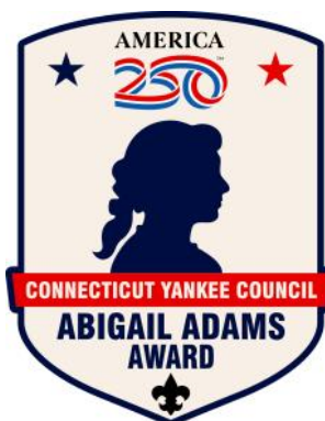
Women of the Revolution Abigail Adams Award Page 8