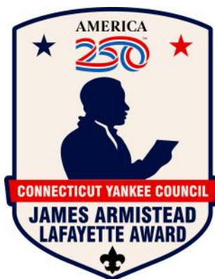
Diversity James Armistead Lafayette Page 6