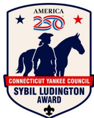
Youth of the Revolution Sybil Ludington Award Page 7