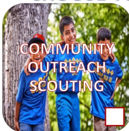
COMMUNITY OUTREACH SCOUTING