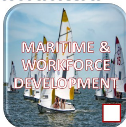
MARITIME & WORKFORCE DEVELOPMENT